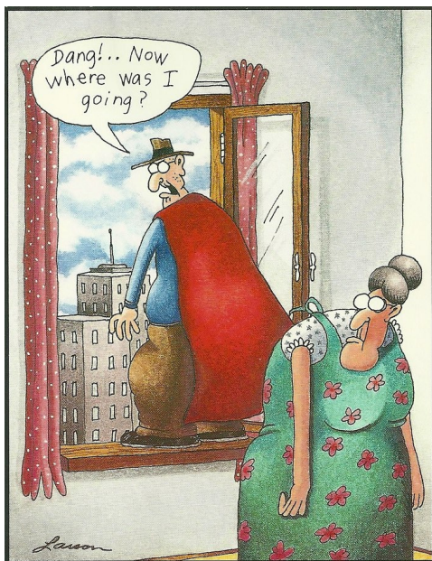
Superman in his later years